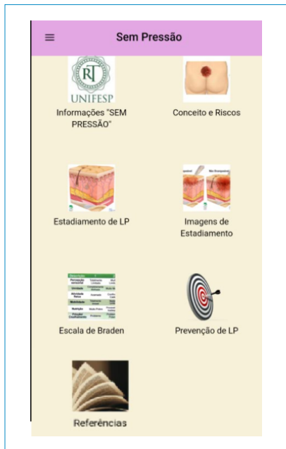
Figure 4. SEM PRESSÃO application pressure injury staging images. São Paulo (SP), Brasil – 2017.