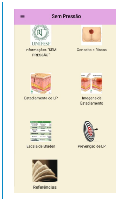
Figure 2. "No Pressure" application home menu screen . São Paulo (SP), Brasil – 2017.

When opening the application, the home screen presents the developed layout. Then automatically follows the page with the home menu. (Fig. 2).