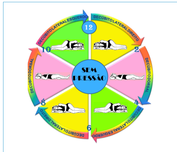
Figure 1. SEM PRESSÃO ('No Pressure') application home screen. São Paulo (SP), Brasil - 2017.

The application developed from the "fábrica de aplicativos" page was called "Sem Pressão" ('No Pressure') (Fig. 1).