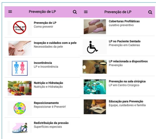
Figure 5. Prevention and sub-items of the application SEM PRESSÃO. São Paulo (SP), Brasil – 2017.